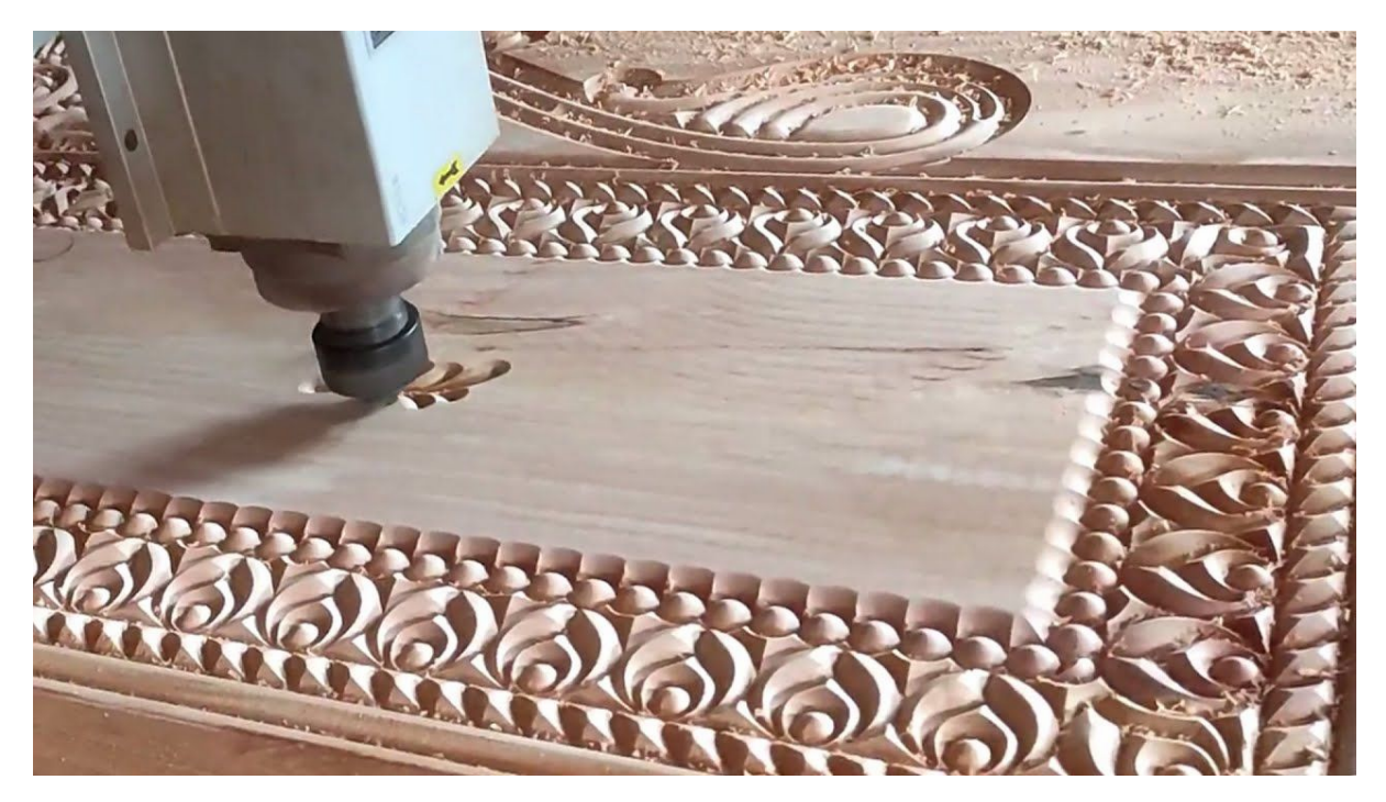
Elaborate Design is now available for the woodworking hobbyist.